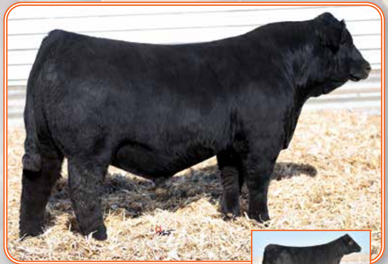
LOT 15 – DJF L3131

This strong aged bull is out of the legendary T739 donor who is recognized as one of the most prolific cows in the ASA with 135 calves and recorded 108 WW and YW ratios on just her natural calves. Lot 15 will be last bull from this cow. A pedigree packed with power!