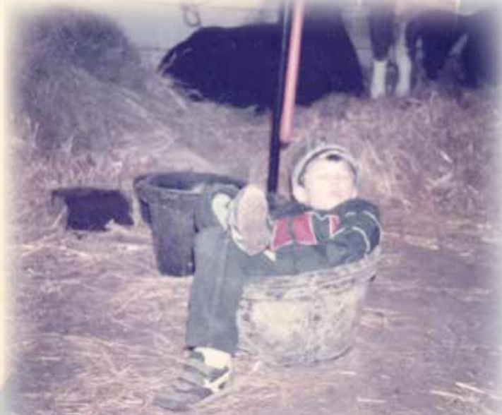
KIPP ON CATTLE WATCH

An eye-appealing red herd sire prospect who is moderate-framed, big bodied, heavy muscled and flexible on his feet and legs. His granddam is the mother of Lots 62 through 66.