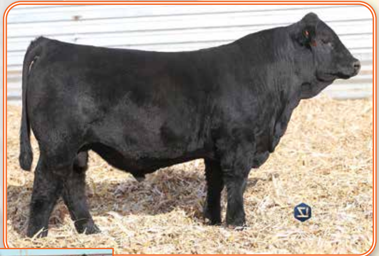
LOT 5 – KRJ L3154

X011 was our top WW heifer in 2010 and sold in the North Dakota State sale and became a lead donor at the Kenner Simmental Ranch as well as our place with 95 calves to date. Weaning and yearling weight EPD's are in the top 3% and 3 Carcass EPD's rank in the top 2%.