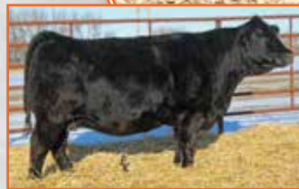
DOUBLE J MISS X011, DAM