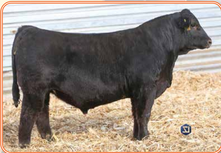
LOT 39 – DJF L380

His mother posted a 106 WW ratio on 3 calves and a 105 YW ratio on 2 with producing last year's high selling bull! This good looking, well-made bull hit the scales with a 1459 YW.