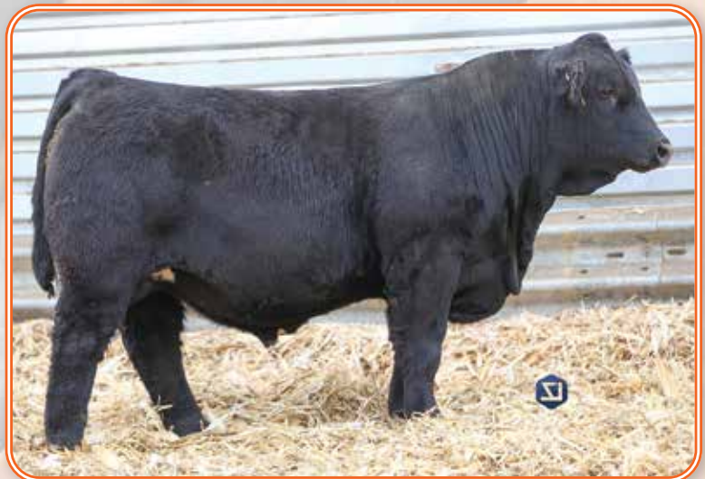
LOT 30 – DJF L351

Well-balanced EPD profile with his maternal brother selling to Traxinger Simmentals last year.