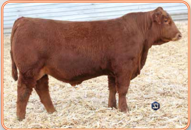
LOT 62 – KRJ L3170

Captivate has been appreciated for his outcross pedigree, impressive number profile and striking phenotype while Mulberry is siring outstanding progeny that are the low maintenance and easy-fleshing type. Between these 5 peas in a pod, there is sure to be one or a few that will fit your needs.