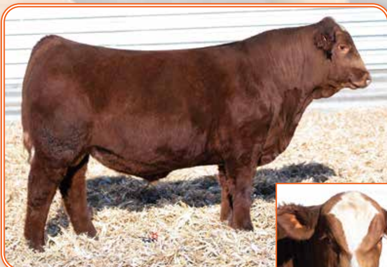
LOT 61 – KRJ L3180

A large-framed red baldy with an outcross pedigree that can cater to different sectors of the industry with his maternal and terminal traits.