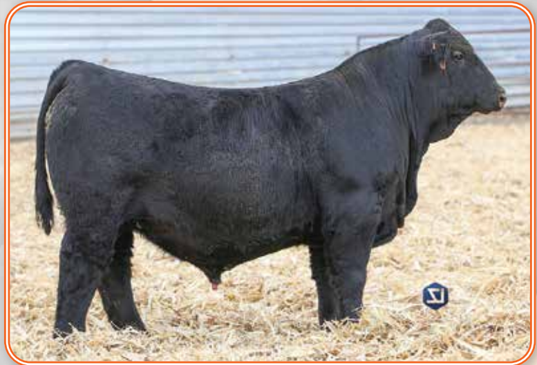
LOT 37 – KRJ L373

Our #1 bull in ADG at 5.19! He also weighed in at 1485 pounds for YW, ranking at #5 with a 109 ratio. Be sure to check out what this big footed, bold bodied, stout made stud has to offer!