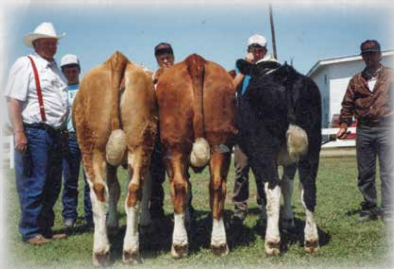
THE COLOR & POLLED CHANGE! EVERY LOT IS HOMO POLLED AND HOMO BLACK (EXCEPT 5 HETRO BLACKS AND THE REDS)!

Thank you for being our partners in success for the past 50 years! THE JULSON FAMILY