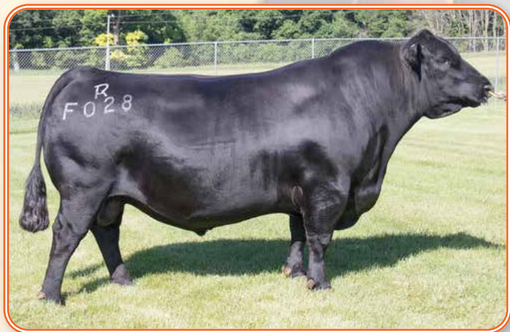
LOT 72 – TEHAMA PATRIARCH F028, AI SIRE