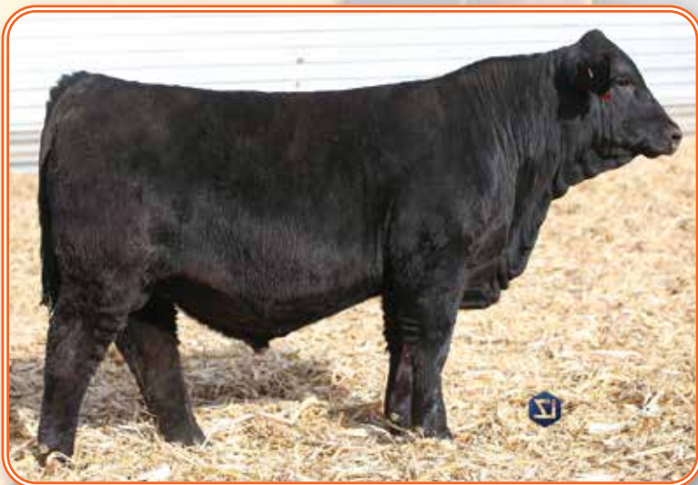
LOT 10 – KRJ L3176