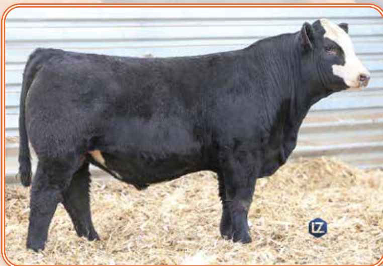
LOT 41 – KRJ L350

Baldy bull assembled in an attractive, smooth-made package that is easy to pick out. 104 WW ratio.