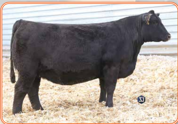
LOT 82 – DJF K256