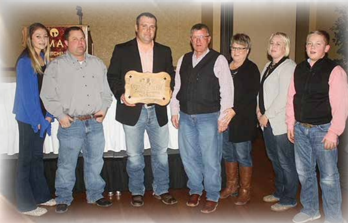
BREEDER OF THE YEAR

When you look at this high end, easy-fleshing ground sow, you will understand why she is so good because she comes from a stellar cow family. She posted a 114 WW ratio with WW and YW EPD's in the top 2% and Milk in the top 10%. This one is bred up to the deceased Golden Book and shouldn't be leaving the place.