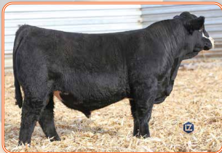
LOT 16 - DJF L354

Jawbreaker has exceeded our expectations in producing high quality cattle with look, muscling and a well-balanced EPD profile. We are planning on utilizing him more in the future! This white-faced bull has been a standout around the place and has been a favorite by many for good reasons!