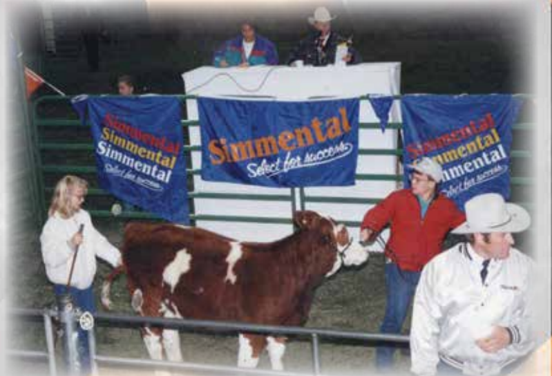
EARLY SOUTH DAKOTA STATE SALES!

Good footed, structurally sound bull backed by an older, proven Angus cow.