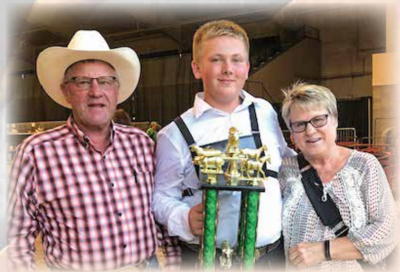
3RD GENERATION ROUND ROBIN CHAMPION

API and TI in the top 10% with a 107 YW ratio. His granddam is E7118, who is our new donor from the great Latisha cow who was crowned as the National Champion Purebred Cow/Calf Pair in 2018.