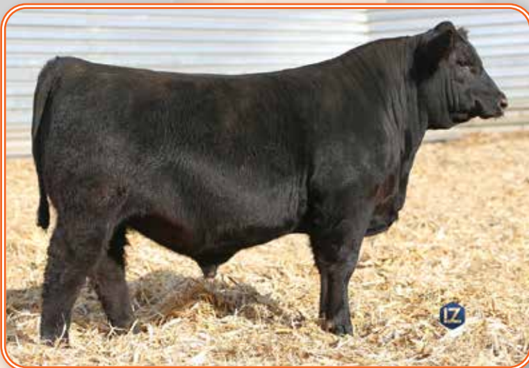
LOT 68 - LONG U GROWTH FUND L336

CE: 12 RE: .74 BW: .3 Fat: .053 WW: 85 $M: 73 YW: 148 $W: 82 CEM: 14 $F: 109 Milk: 35 $G: 52 MW: 77 $B: 161 CW: 65 $C: 282 Marb: .68