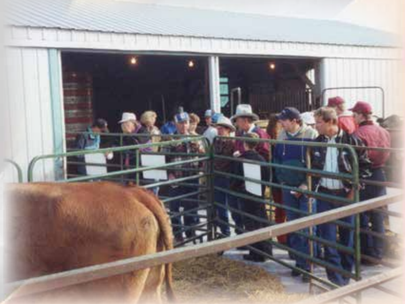
SD SIMMENTAL, BEEF BREEDS, & CATTELMEN'S TOURS!

Calving ease and birth weight EPD's are both in the top 10%. His granddam raised the Lot 1 bull