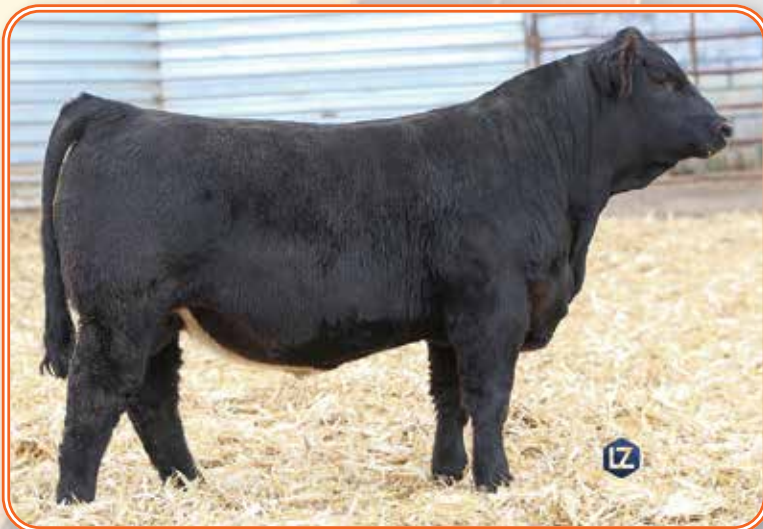
LOT 45 - KRJ L330

CE: 19 DOC: 14.2 BW: -4.2 CW: 35.5 WW: 79 YG: -.35 YW: 121 Marb: .32 ADG: .26 BF: -.072 MCE: 9 REA: .87 Milk: 32 API: 145 MWW: 71 TI: 89 Stay: 13