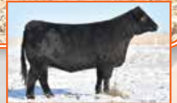
DOUBLE J MISS T739, DAM