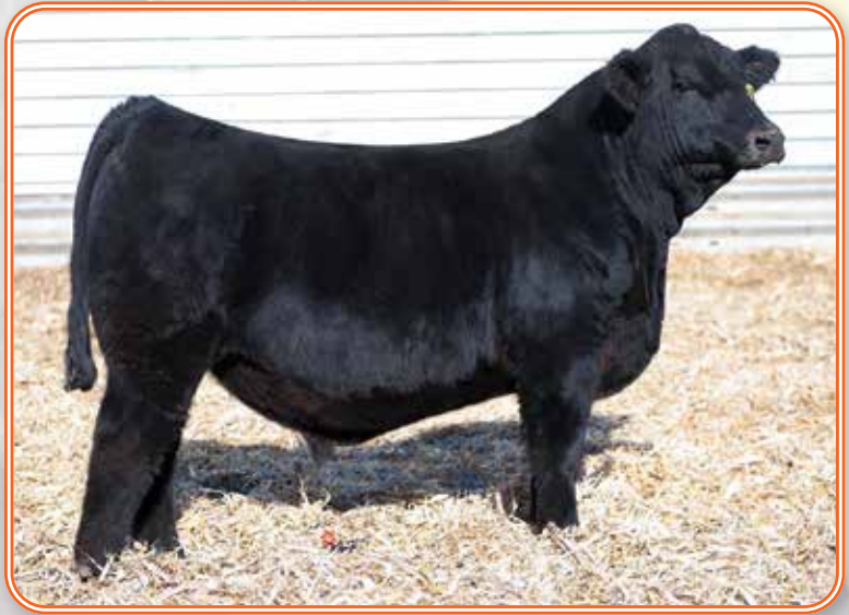
LOT 36 – DJF L3103

Good-structured bull with added rib shape and eye appeal that posted a 106 WW ratio as well as a 104 YW ratio.