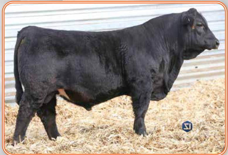
LOT 29 – DJF L378