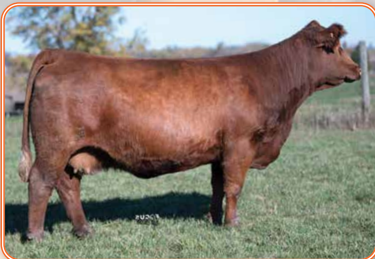
LOT 60 – OMF/DK DARLING D49, DAM

His mother, Darling produced KRJ Direct Impact who sold to Dakota Express in 2019. Captivate commanded $95,000 with a lot of seedstock producers chasing him. A combination of two powerful bloodlines found in this one here!