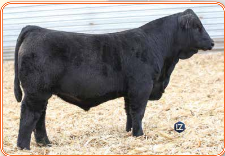
LOT 7 – KRJ L3197