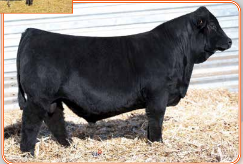
LOT 6 – KRJ L3189

Another Outlaw calf that has eye appeal, rib dimension and added muscle shape. Hit the scales with a 797 pound weaning weight.