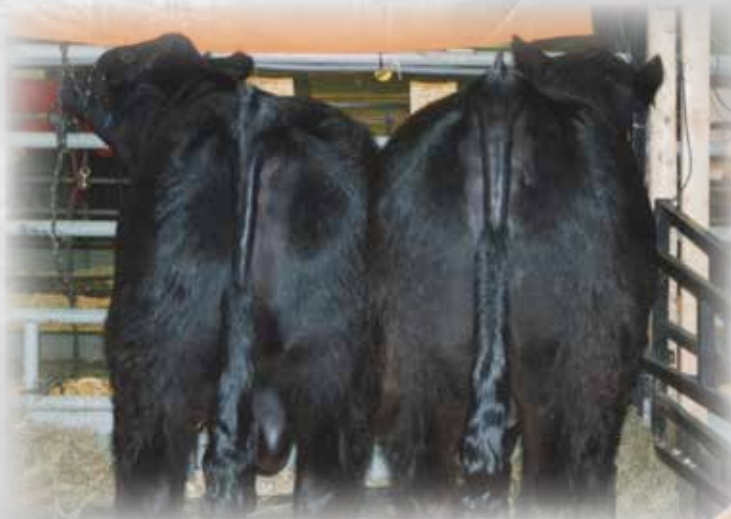
SIRES OF THE 80S – JET BLACK, BLACK MAX & 600U