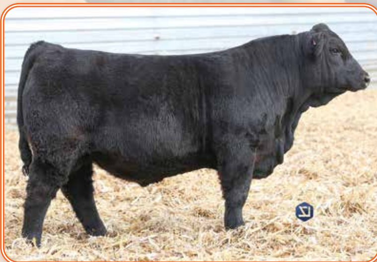
LOT 27 - KRJ L382

This Conoco, Boise, Dew It Right cross should work exceptionally well as his maternal brother sold to Flying F Ranch last year.