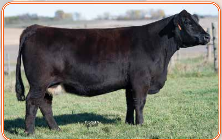
LOT 2 – CMW ML GINGER 101D, MATERNAL GRANDAM