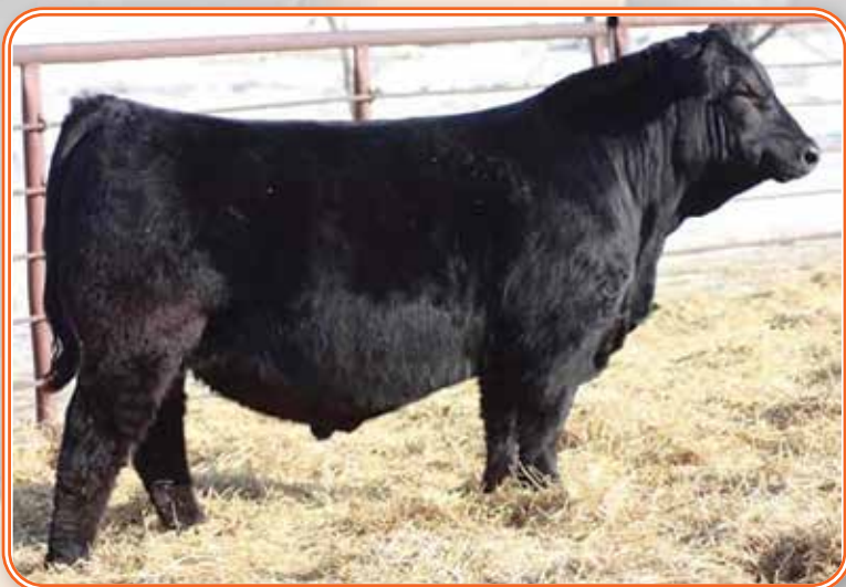
LOT 11 – W/C REVOLUTION 65G, SIRE OF LOTS 9-14