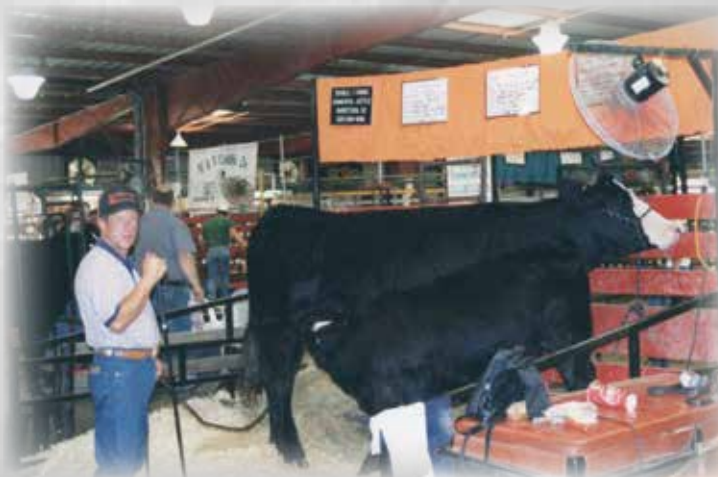
SOUTH DAKOTA STATE FAIR 1998