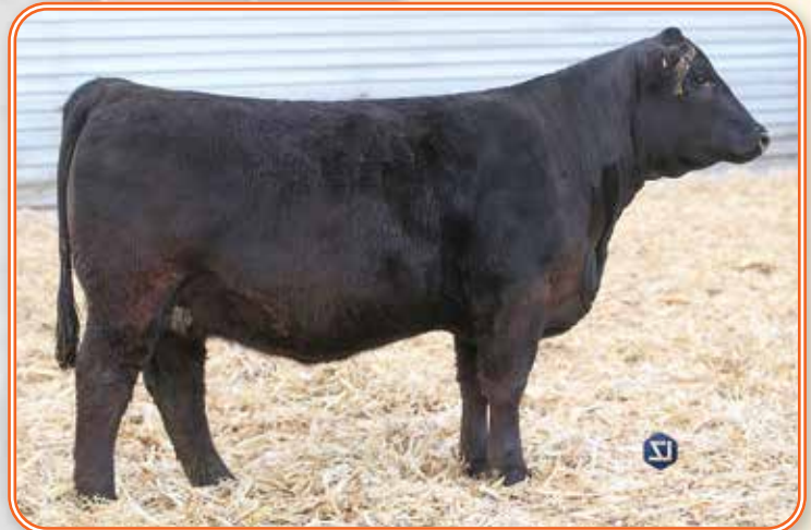
LOT 75 - DJF K259

This good looking, bigger profiling heifer features 2 donors in her pedigree with the Lot 29 bull being her maternal sib. Being AI safe to Essential should only add profitability to this mating.