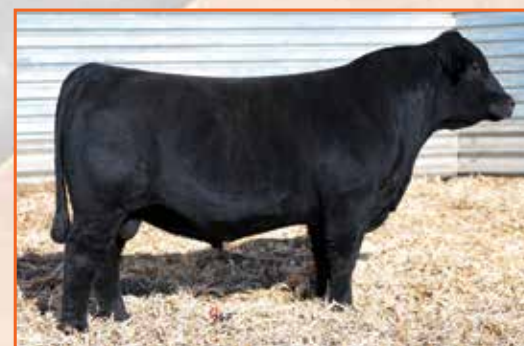
BSTR KRJ SPOTLIGHT K295 – ASA#4200033 – SEMEN $30 FULL BROTHER

We have been blessed to be in this business for 50 years and are proud of the cattle we have produced throughout the years. I knew a year ago this heifer was going to be the lead off female for our 50th Anniversary Sale. This will be the last opportunity to obtain a full sibling to Dakota Outlaw, Jesse James and Spotlight. A pedigree that has been found by great cattlemen and with this mating to Falcon, the calf in her belly should command high dollars and generate income!