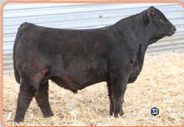
LOT 43 – DJF L319

We are starting of the Arrowhead sire group with this bigger-framed bull from a first calf Outlaw daughter that possesses the power and eye appeal that Outlaw continues to pass on through generations. This bull is in the top 3% and 5% for WW and YW EPD's in addition to Maternal Milk in the top 20%. His granddam has produced high end bulls for great cattlemen including Cody, Fiegen, Pfeifer, and Gilliland.