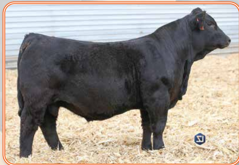
LOT 3 - KRJ L377

Outlaw calves are the type cattlemen are after with a lot of rib shape and muscling that don't shrink when you sell them at the sale barn. This bull has added growth with carcass traits in the top 2%.