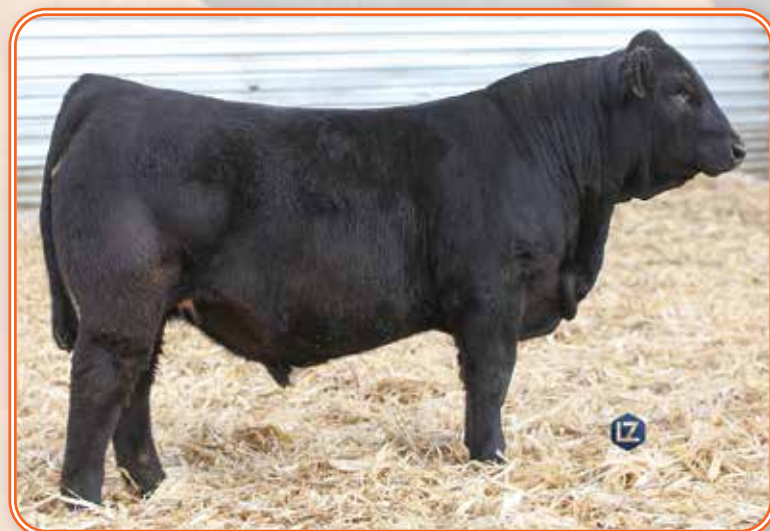
LOT 4 - KRJ L363