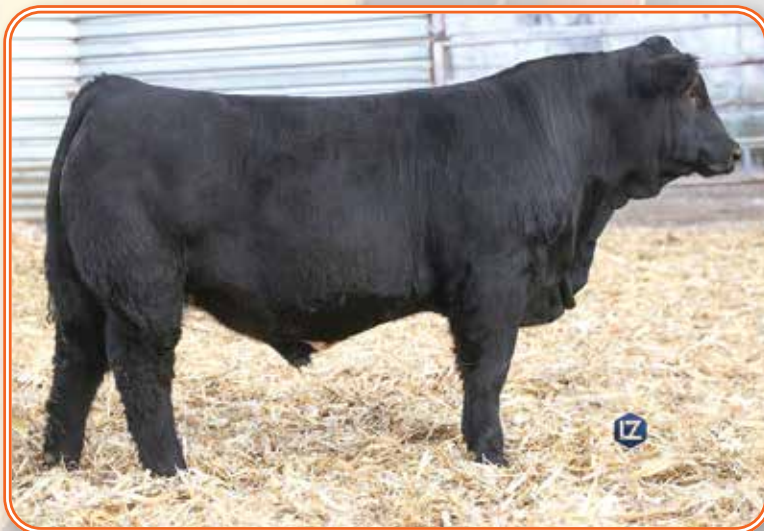
LOT 31 - DJF L332