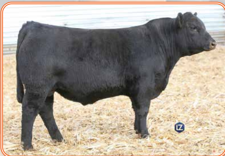
LOT 40 – KRJ L339

Here's a potential heifer bull with the combination of a small head and smooth look. This Homeland son has a balanced EPD spread and is backed by a good Angus cow family.