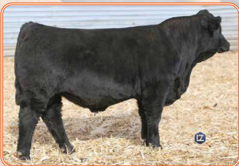
LOT 12 – KRJ L3161