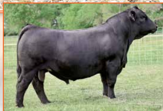
KRJ DAKOTA OUTLAW G974 – ASA#3632499 – SEMEN $50 FULL BROTHER