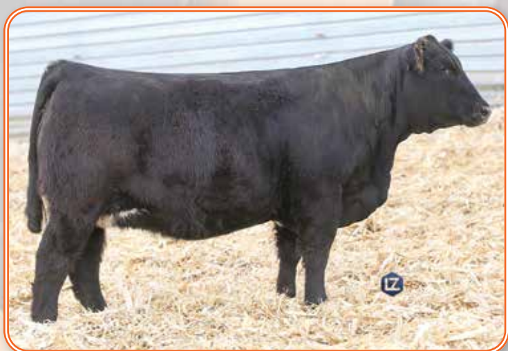
LOT 73 – DJF K228

This bulletproof maternal pedigree and mated to Patriarch will have the right phenotype to produce both quality females and high demanding sons.