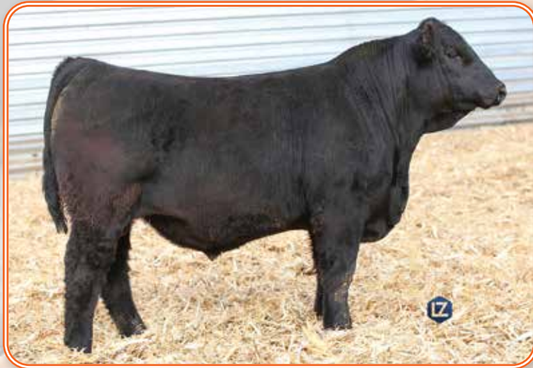
LOT 44 – KRJ L303

Potential heifer bull with added frame and a big scrotal measurement. Tied at #4 with a 4.91 ADG, marked a 103 WW ratio and ranked as our #4 YW bull weighing 1495 pounds! This bull comes with a great EPD profile and is backed by a top producing cow family going back to Z228, the maternal granddam of Lot 1.