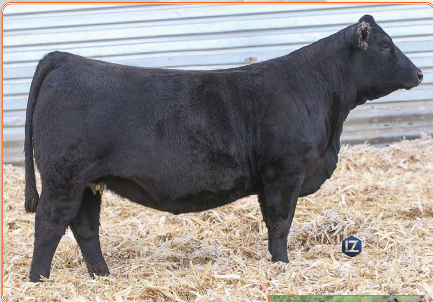
LOT 71 – KRJ K2171