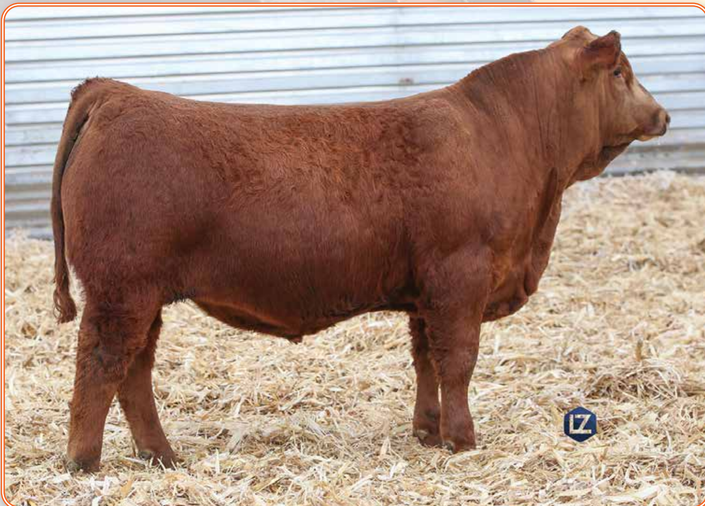
LOT 58 – KRJ L374