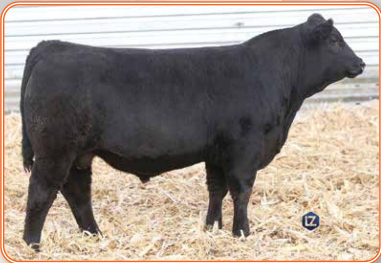
LOT 8 – KRJ L3130

This large-framed X011 son posted our #1 weight per day of age at 4.43 and our #3 average daily gain at 4.93.