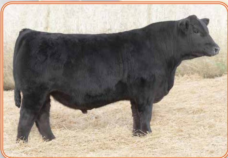
LOT 42 – CLRS HOMELAND 327H, SIRE

This second calf dam posted a 105 WW ratio on 2 calves with this one equipped with high-carcass traits.